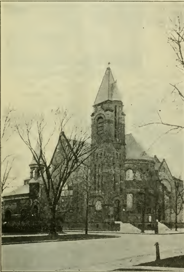
BROAD STREET CHURCH IN WHICH THE ASSEMBLY MET